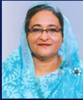
Honorable Prime Minister Sheikh Hasina, MP