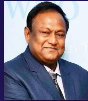
Honorable Minister of Commerce Tipu Munshi, MP